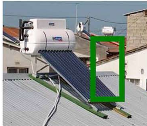
These geysers are fine

These must be switched off These geysers are fine